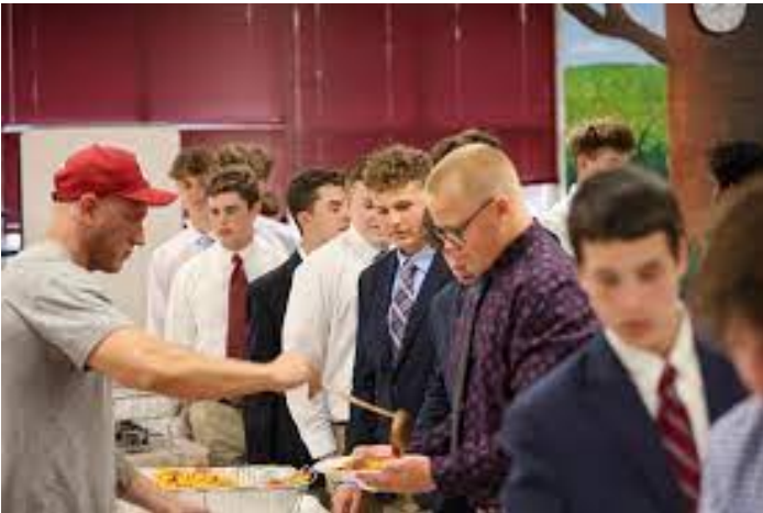
Sports Breakfast 2023

It's truly remarkable to see how the school year has unfolded with so much excitement and energy. As we approach the end, it is time to recognize and honor many of the talented student-athletes. Dunmore High School hosts the highly anticipated sports breakfast every year in May. This tradition has been a part of the school's culture for many years, serving as a momentous occasion to recognize and applaud the exceptional achievements of our talented athletes.